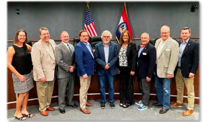
Parkville Board of Aldermen