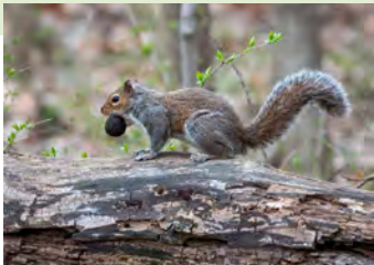
Phil Jeffries, Breakfast of Champions