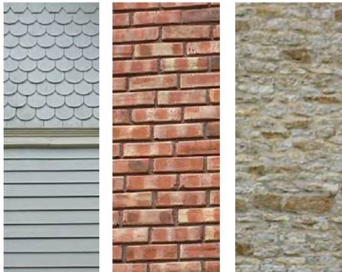
Examples of exterior building materials (brick, stone and painted wood) used traditionally on single-family homes

On January 9 th , the Planning & Zoning Commission considered an amendment to the preliminary development plan for APEX Plaza, a commercial shopping center located at the northwest corner of the intersection of Highway 45 and Melody Lane. The amendment proposes Chase Bank on Lot 4 of the development, which resides to the east of the Westlake ACE Hardware, Whataburger and the building with Domino's, Rooster Men's Grooming and Verizon Wireless.