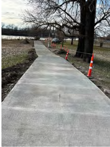
Trail Looking south from Waddell Bridge