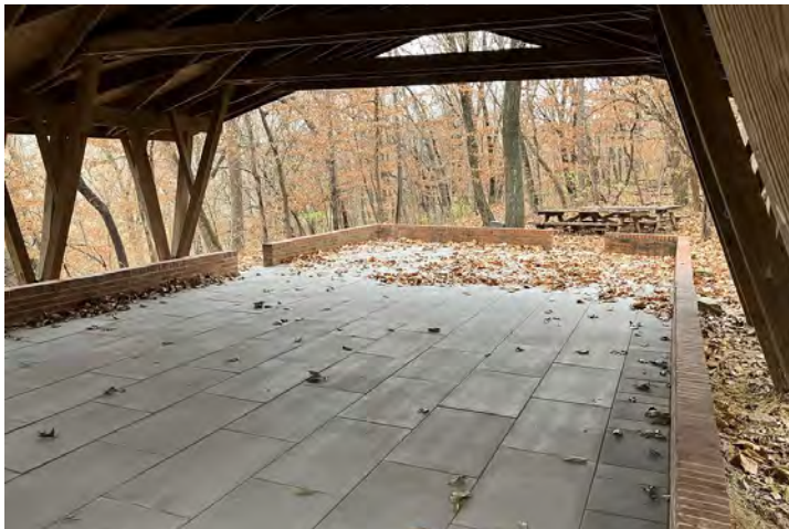
Parkville Nature Sanctuary Girl Scout Cabin Floor