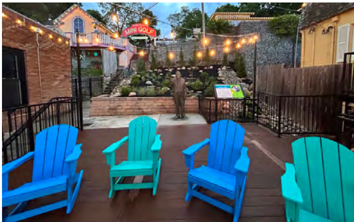
Pocket Park looking west from upper terrace