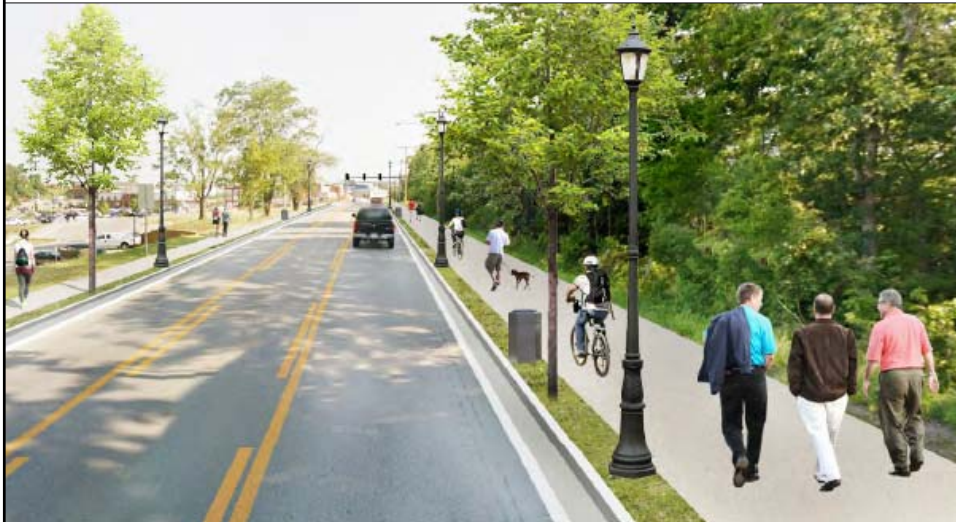
Looking North towards Clark Ave