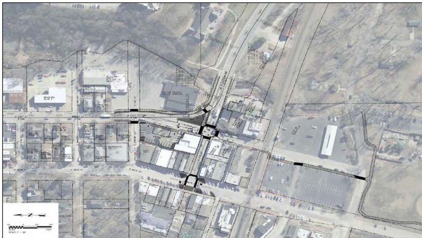
2 nd St. to White Alloe Creek