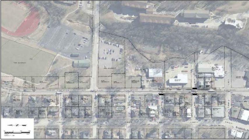
5 th St. to 2 nd St.