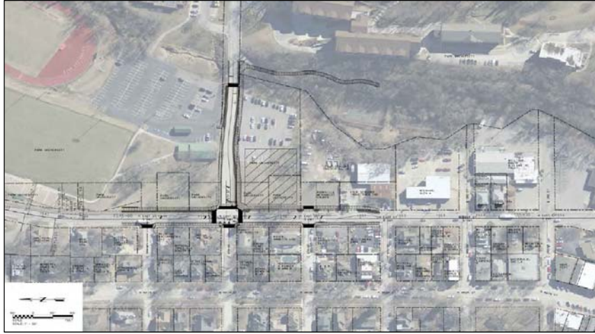
7 th St. to 5 th St.